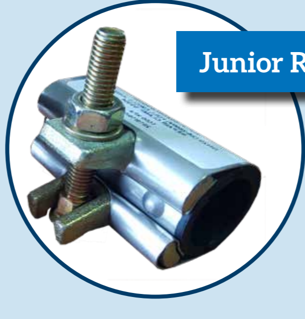
Junior Repair Clamp